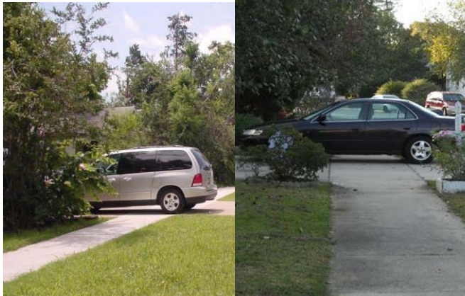
Examples of obstructed sidewalks – Not Leeland Station resident's cars

We still need to remind resident's that not only is it illegal to obstruct a sidewalk, it's downright un-neighborly. Complaints have been made about resident's parking in driveways to a point the overflow obstructs the sidewalk and not clearing sidewalks after a snowfall.